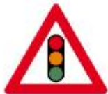
Traffic lights ahead