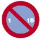
No parking from the 1 st to the 15 th of the month