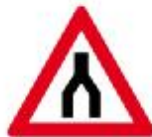
Dual carriageway ends