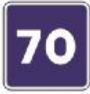
Advisory maximum speed limit