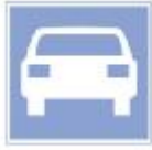
Motor vehicles only