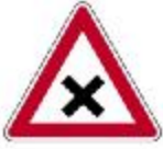
Crossroads with right of way from the right